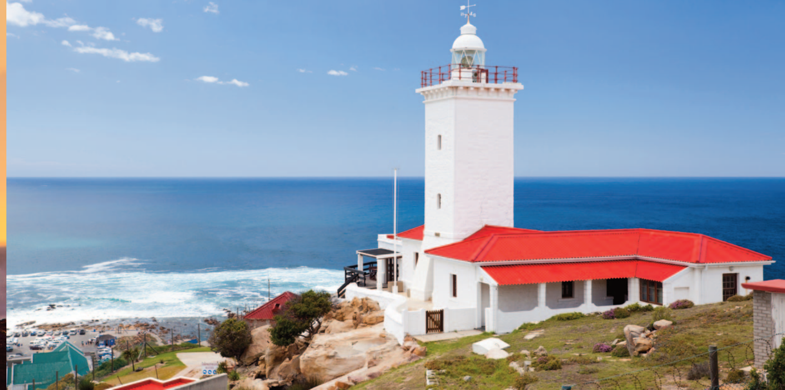
Mossel Bay Lighthouse