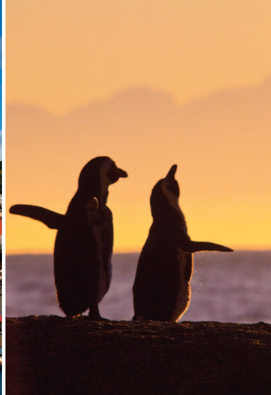
African Penguins, Boulders Beach