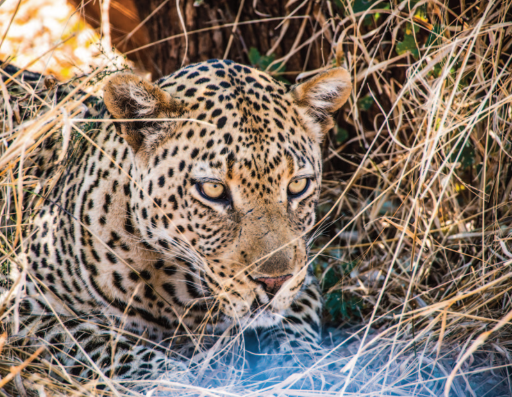
Kruger National Park