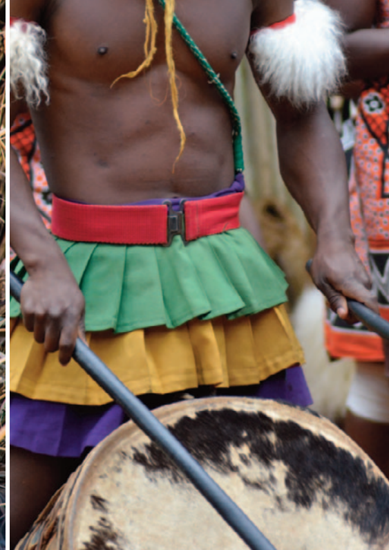
Mantenga Cultural Village