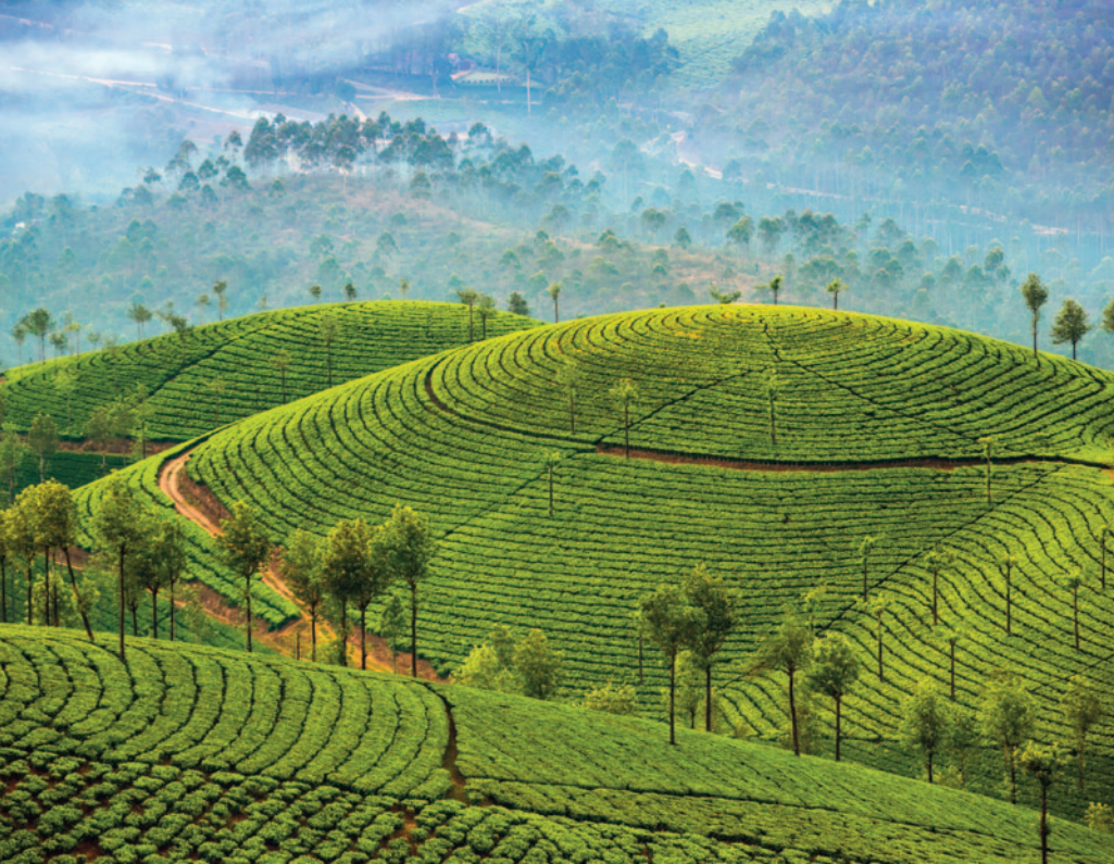
Tea plantation, Munnar