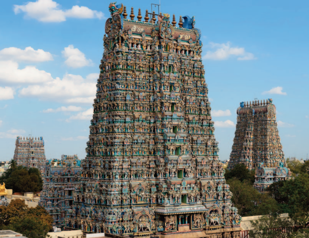
Meenakshi Temple, Madurai