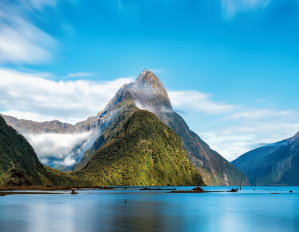
Mitre Peak, Milford Sound