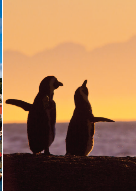
African Penguins, Boulders Beach