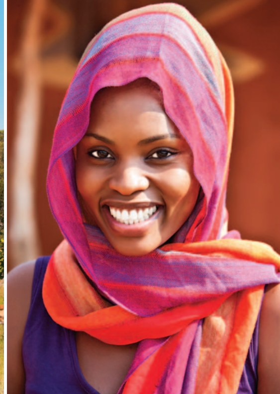
African Penguins, Boulders Beach