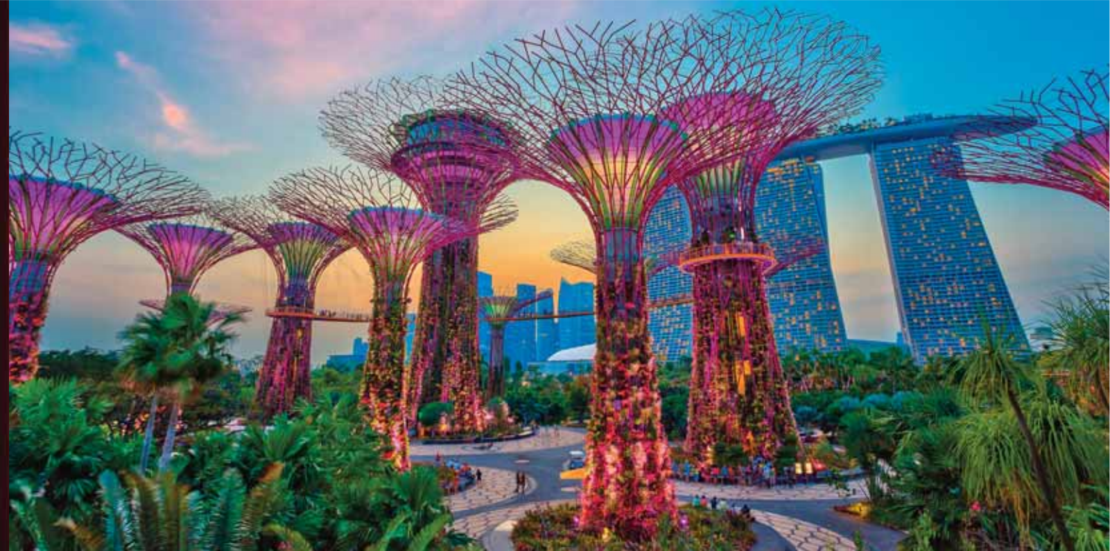
Gardens by the Bay, Singapore