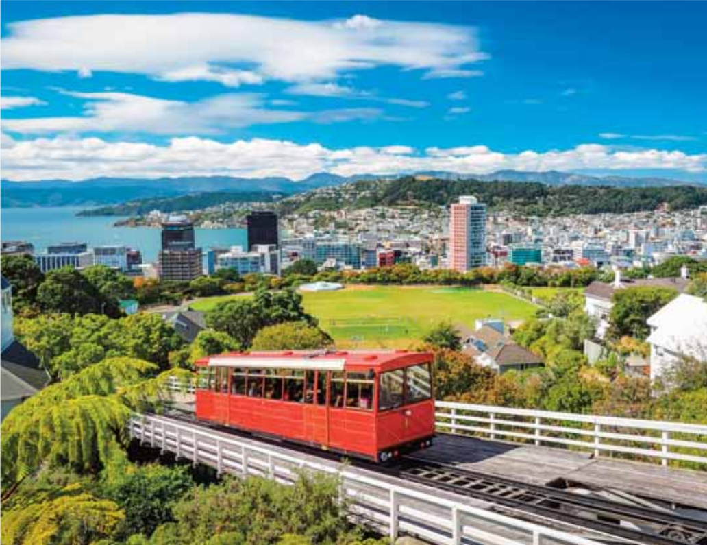
Cable Car, Wellington