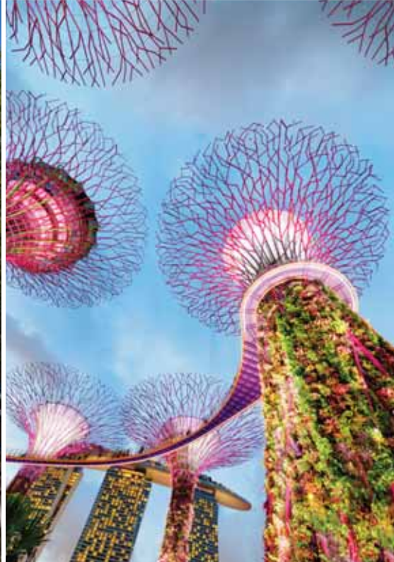
Gardens by the Bay, Singapore