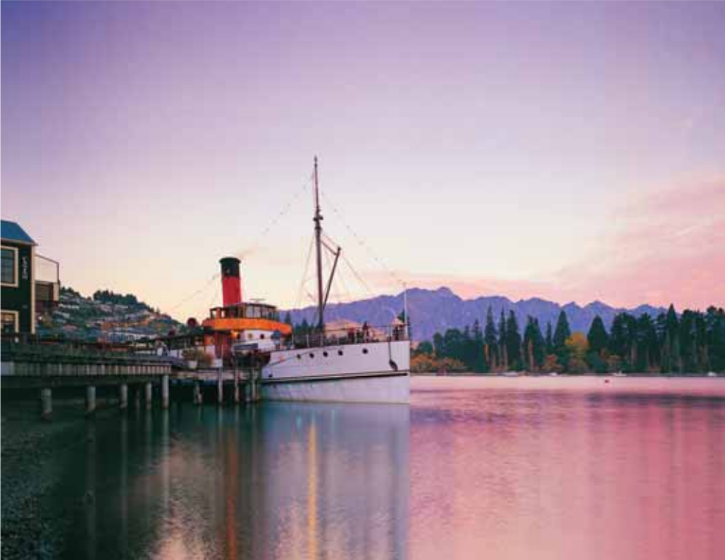
TSS Earnslaw, Queenstown