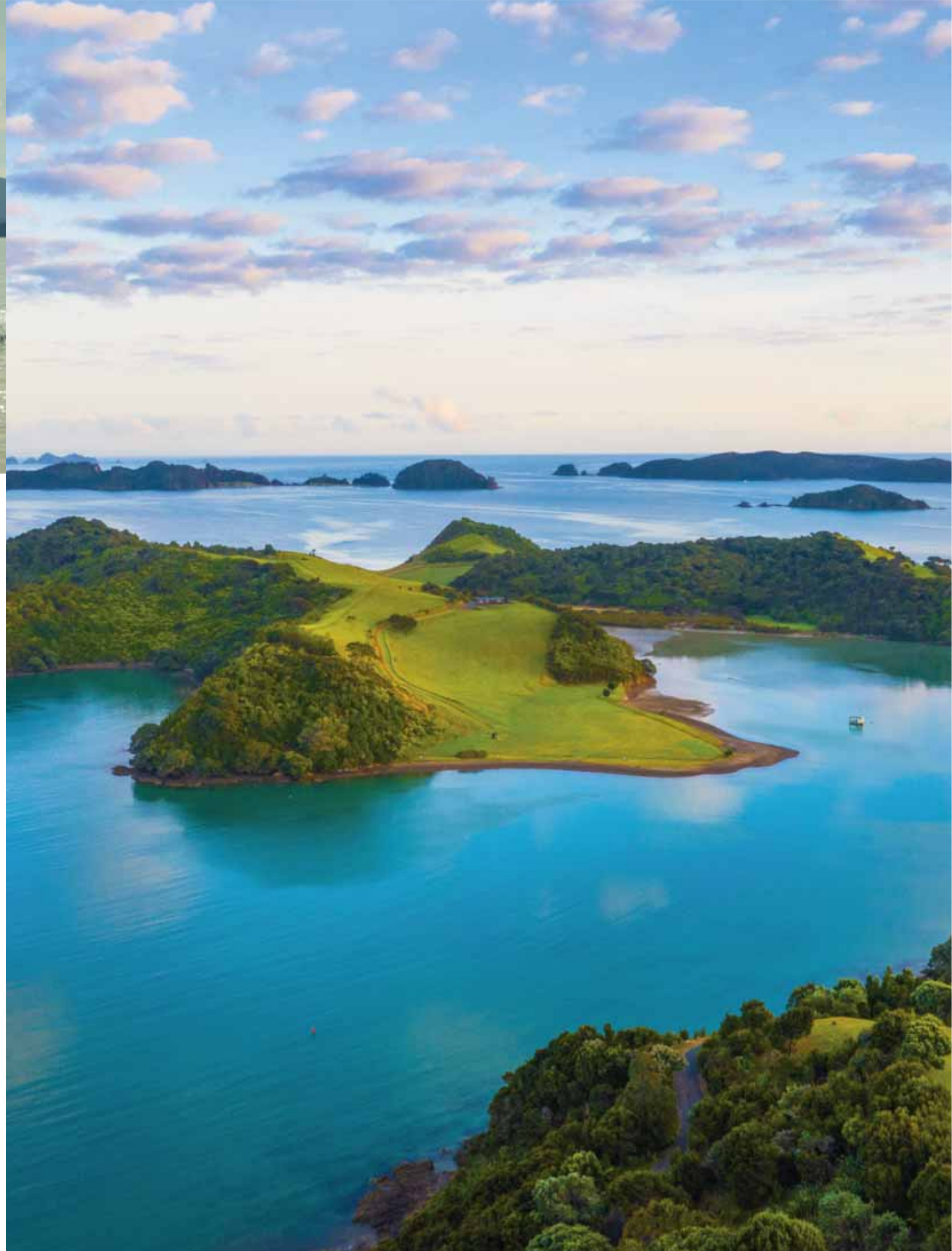
Bay of Islands

Please see pages 82-89 for more details.