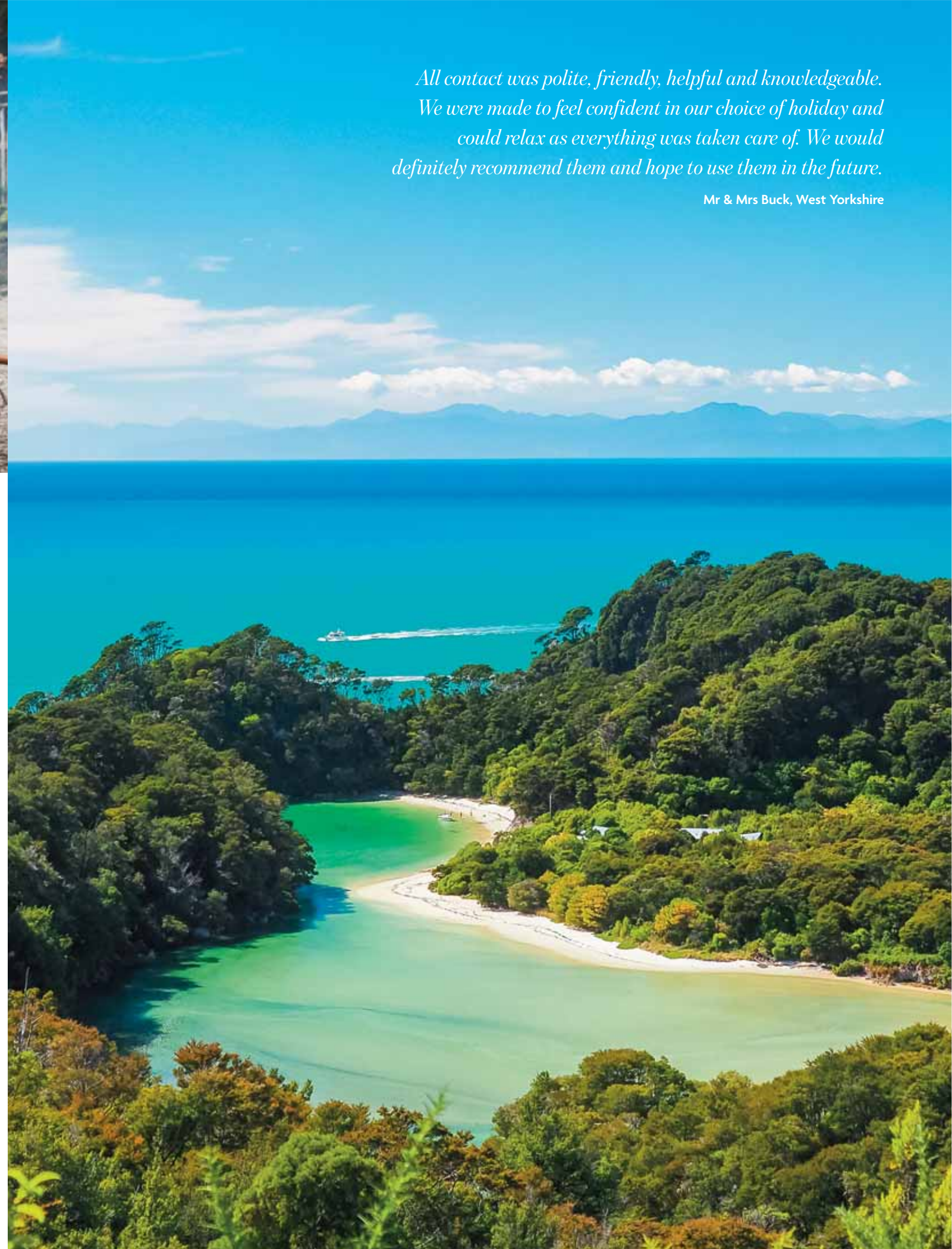
Abel Tasman National Park