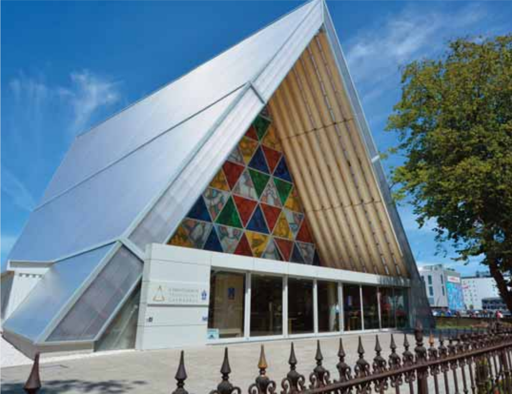
Cardboard Cathedral, Christchurch