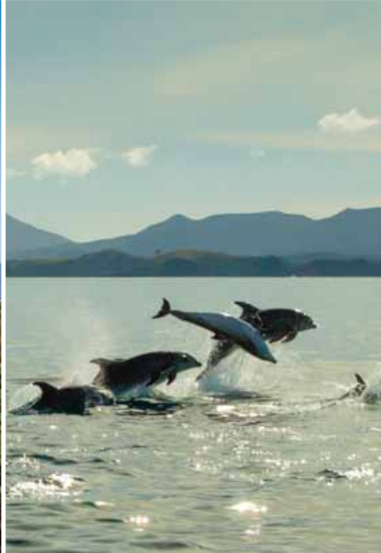
Dolphins, Bay of Islands