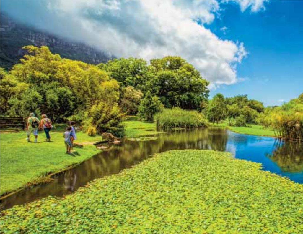
Kirstenbosch Botanical Gardens