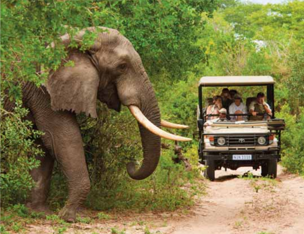
Hluhluwe-iMfolozi Game Reserve