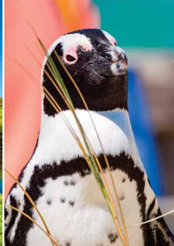
African Penguin, Boulders Beach