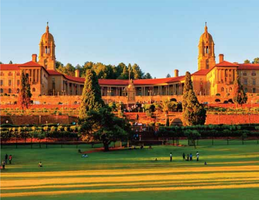
Union Buildings, Pretoria