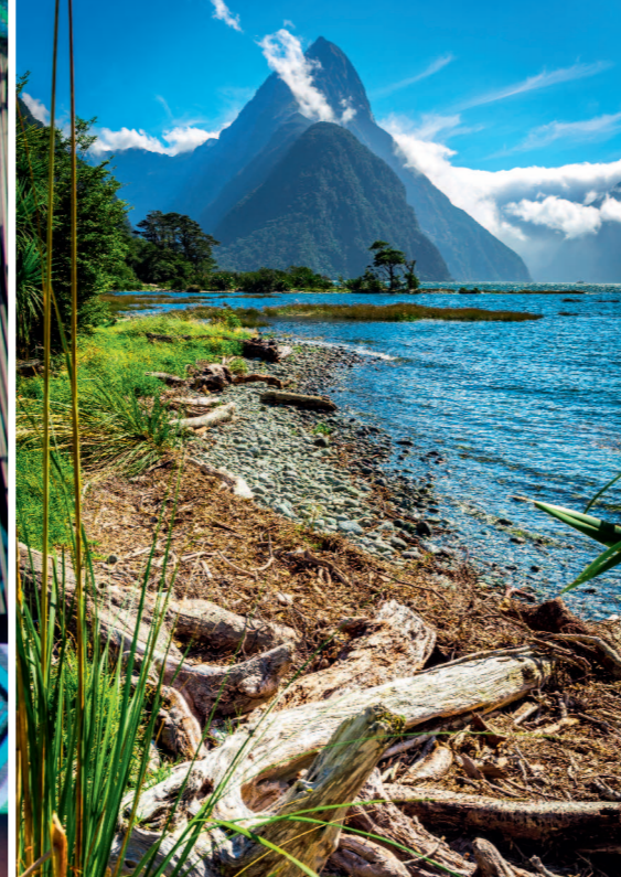
Mitre Peak, Milford Sound