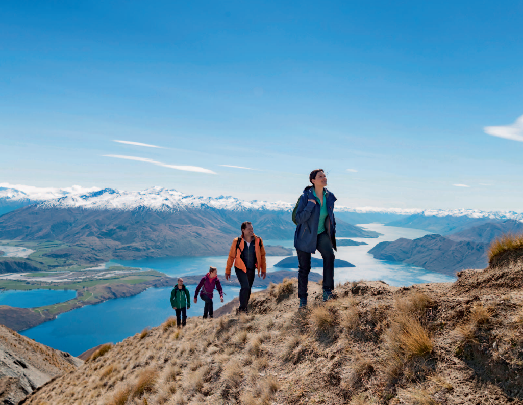
Southern Alps, New Zealand