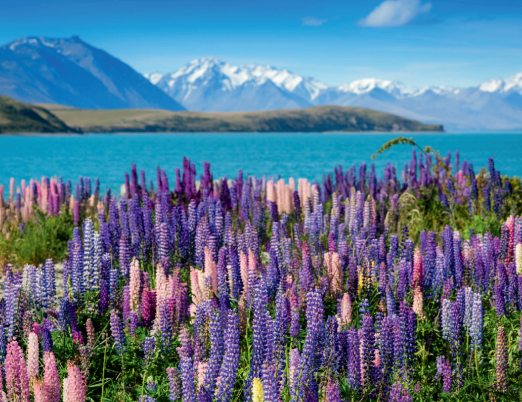
Southern Alps, New Zealand