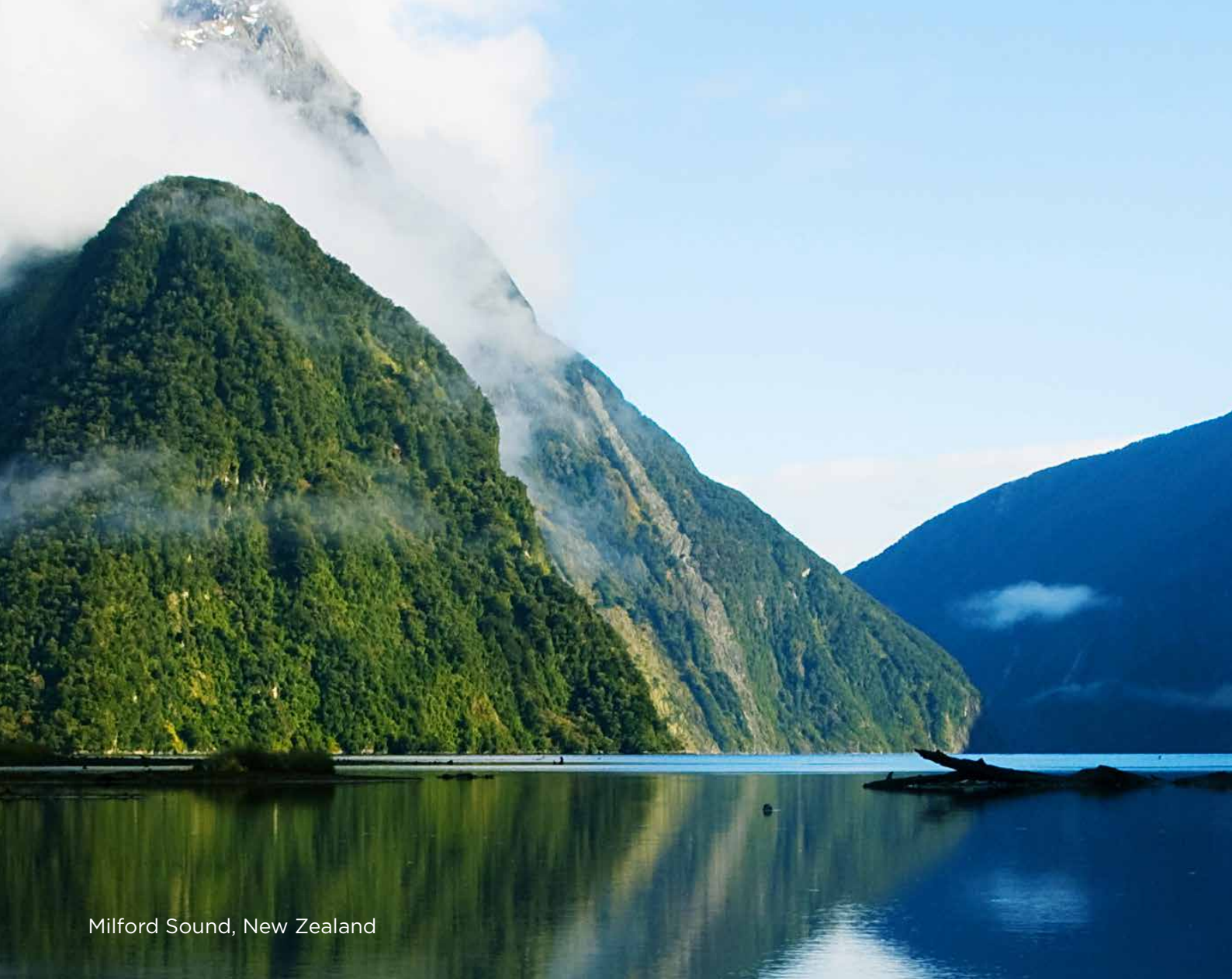
Milford Sound, New Zealand