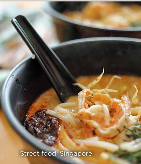
Street food, Singapore