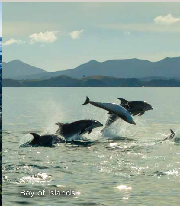
Bay of Islands