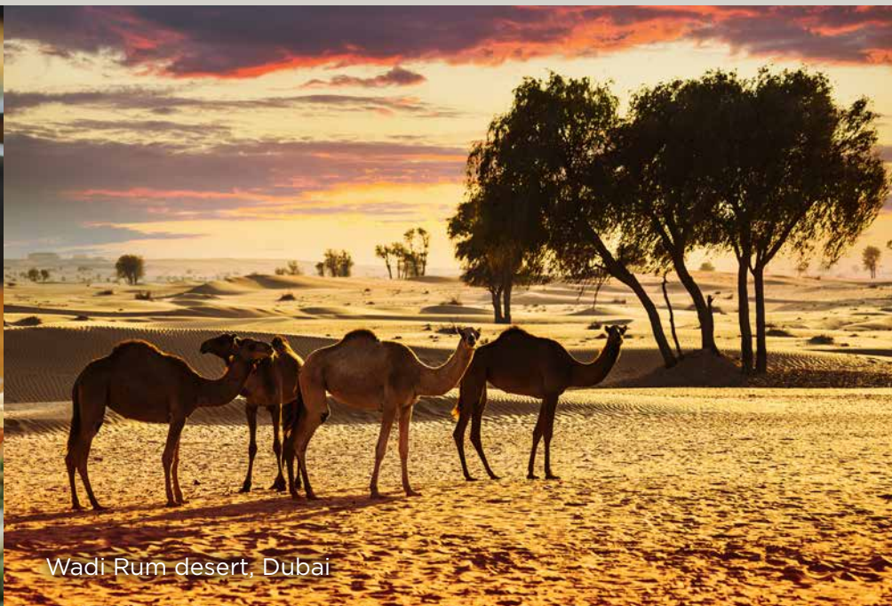
Wadi Rum desert, Dubai