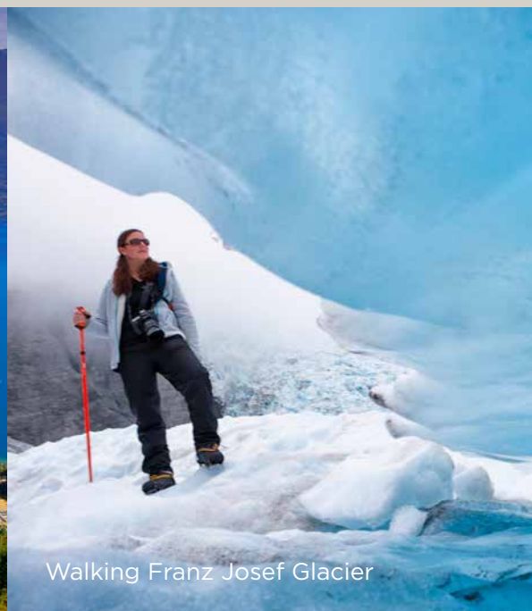
Walking Franz Josef Glacier