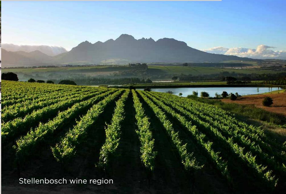
Stellenbosch wine region