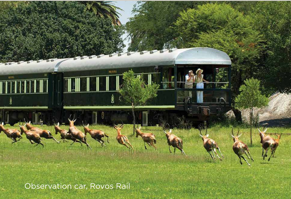
Observation car, Rovos Rail

Days 4 to 6: Rovos Rail Durban Safari - Durban