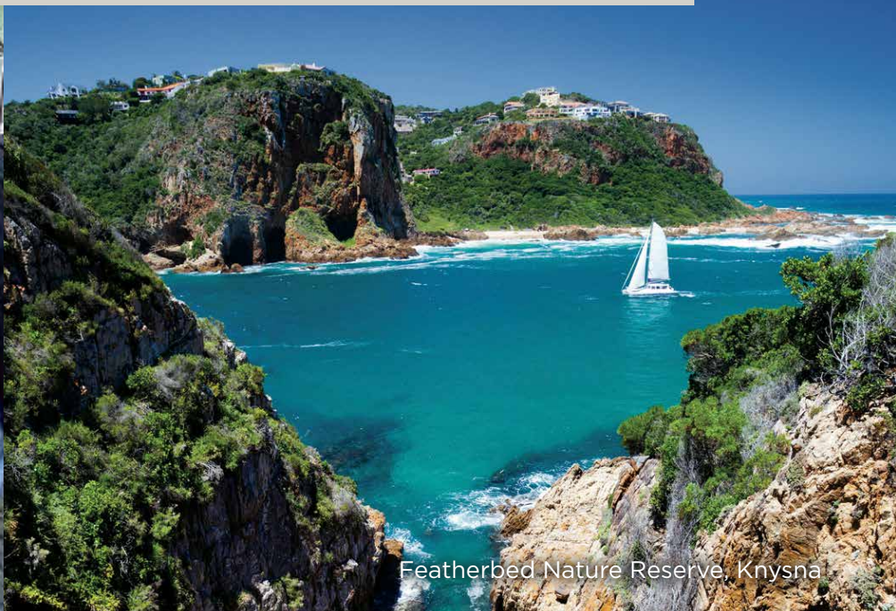
Featherbed Nature Reserve, Knysna