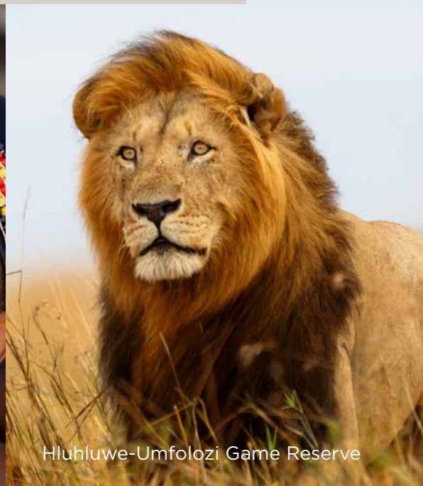
Hluhluwe-Umfolozi Game Reserve