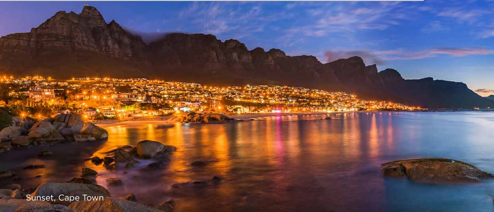
Sunset, Cape Town