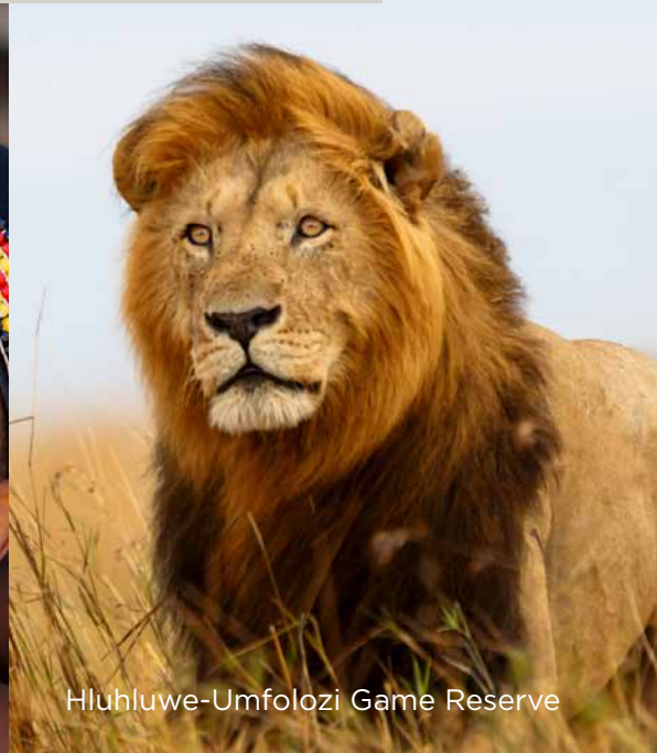
Hluhluwe-Umfolozi Game Reserve